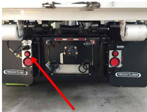
BODY AIR AND LIGHTING CONNECTIONS