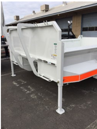
BODY LEGS DOWN FOR BETTER ACCESS WHEN HOOKING UP CABLE/ ROPE